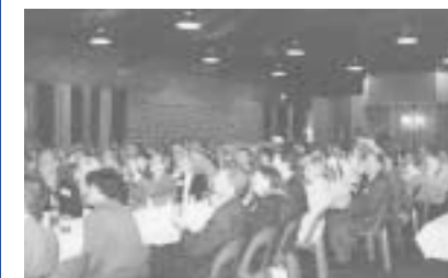
Part of large crowd enjoying the 100th Annual Banquet.