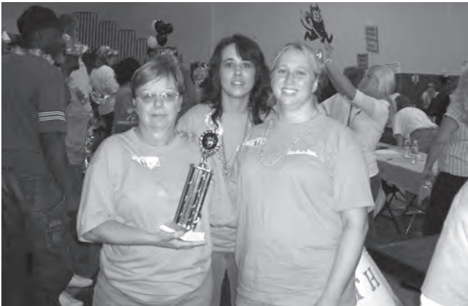
First South Bank - Winner of the Corporate "Spirit Award" 2007 Adult Team Spelling Bee - October 23rd