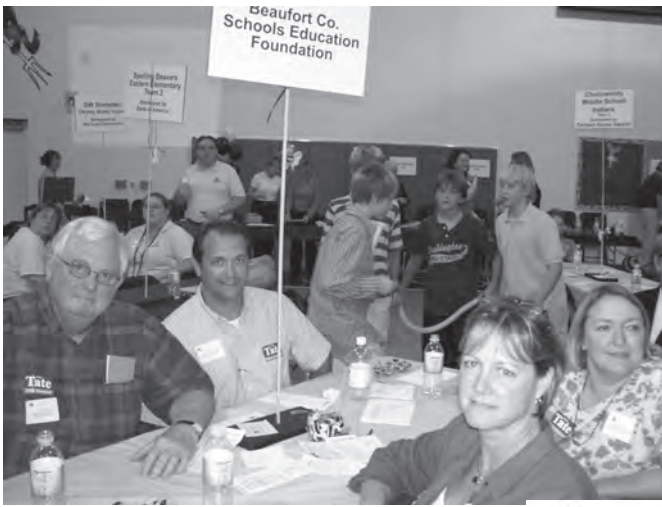
Beaufort County Schools Education Foundation - Winner of 2007 Adult Team Spelling Bee - October 23rd.