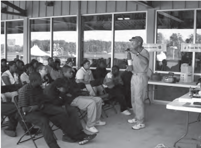
US Power Squadron demonstrates Boating Safety to 8th graders at Maritime Education Days in September