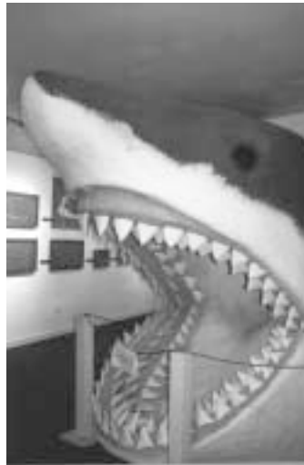
Aurora Fossil Museum Co-Sponsored Business After Hours with PCS Phosphate.