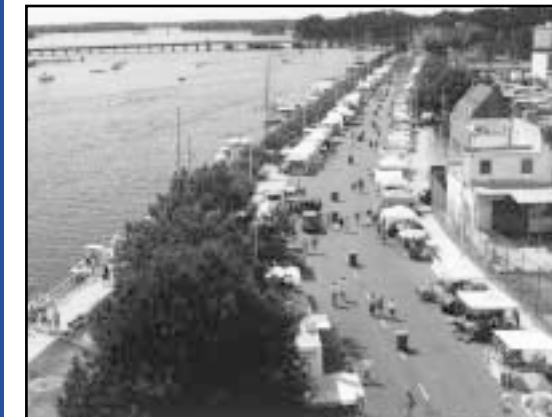
1995 view of Summer Festival. Come this year to see the changes!