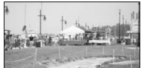
Views of 2002 Summer Festival on the waterfront.