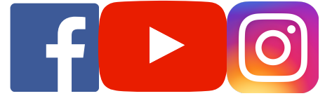
Sharing Socials & Posts - Please Tag Us!