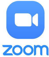
Networking & Informative Zoom Meetings