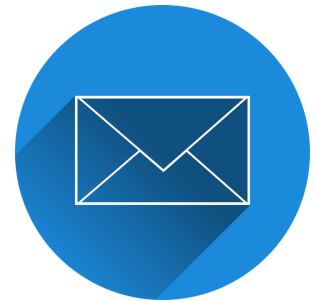
Emails & Weekly Chambergram