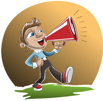
Daily Updates & Announcements