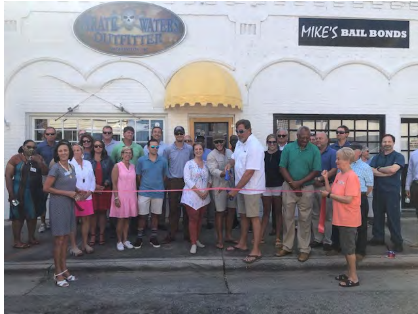
Pirate Waters Outfitter 108 N. Market St. in Washington, NC