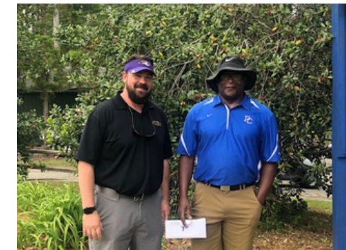
3rd Flight 3rd Place - City of Washington