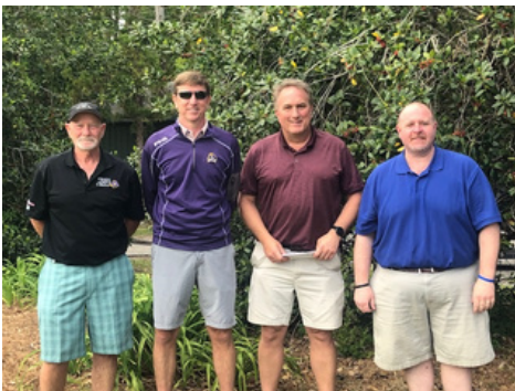
3rd Flight 1st Place - Colombo Kichin Attorneys