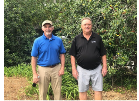
1st Flight 3rd Place - Campbell Construction