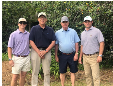
2nd Flight 2nd Place - Russell's