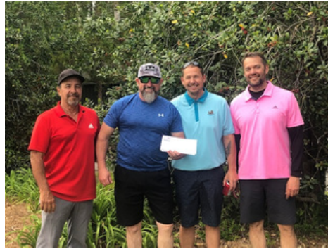
1st Flight 2nd Place - Beaver Dam Farms