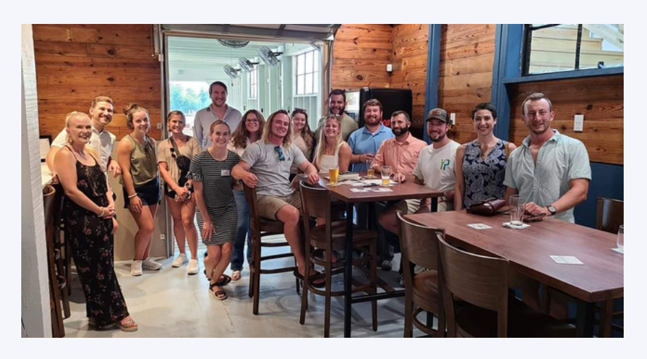
Did you know...

The Washington - Beaufort County Chamber of Commerce sponsors a group called Washington Young Professionals. Their mission is to provide young individuals with opportunities to develop professionally, cultivate relationships, and socialize in the Washington community. Check out our website or Facebook for more information.